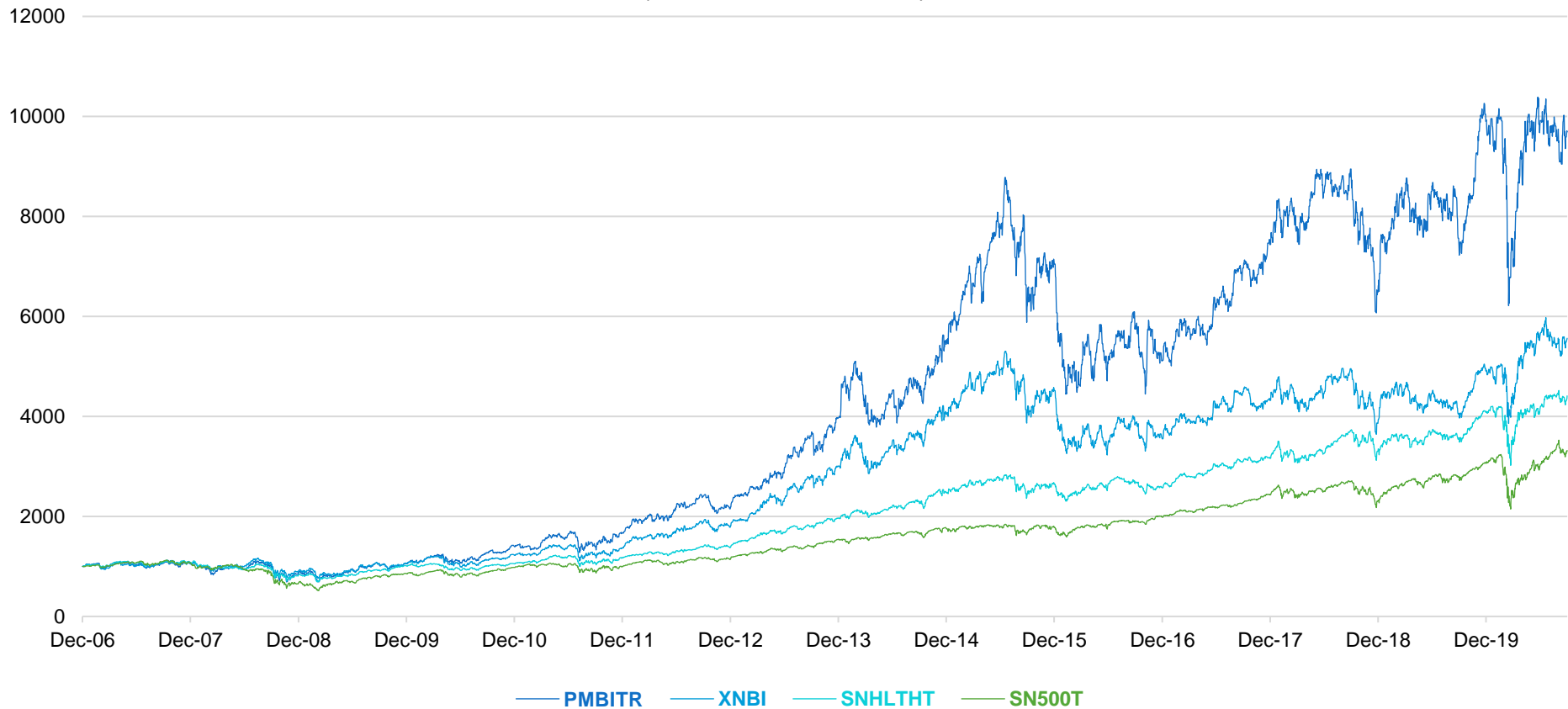
Poliwogg Medical Breakthroughs Index vs. Benchmarks (12/31/2006–9/30/2020)

*To ensure fair comparisons, all of the starting index values are normalized to 1,000 as of December 31, 2006.