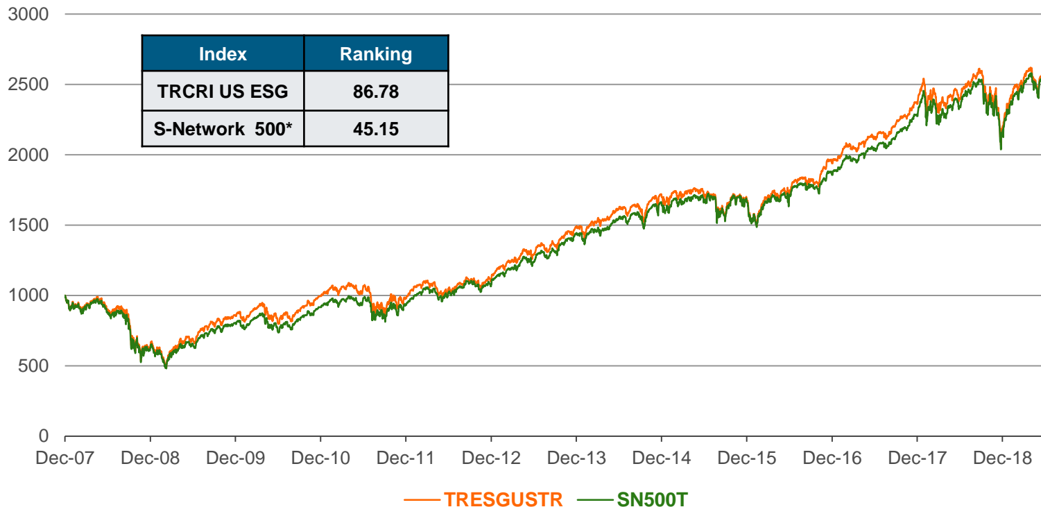
Thomson Reuters/S-Network US ESG Best Practices TR vs. S&P 500 TR 12/31/2007–6/30/2019

*Average ranking of constituents included in the benchmark index but not included in the Thomson Reuters/S-Network ESG Best Practices Index